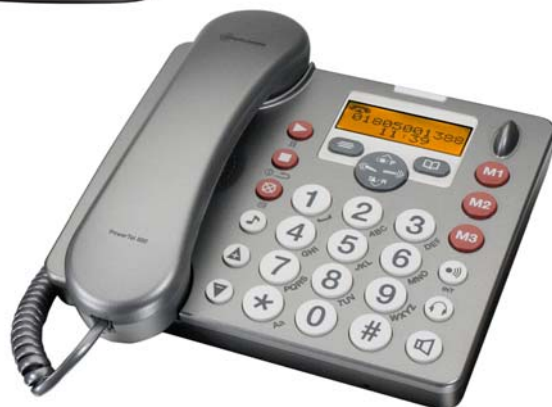
Extra bright signal LEDs